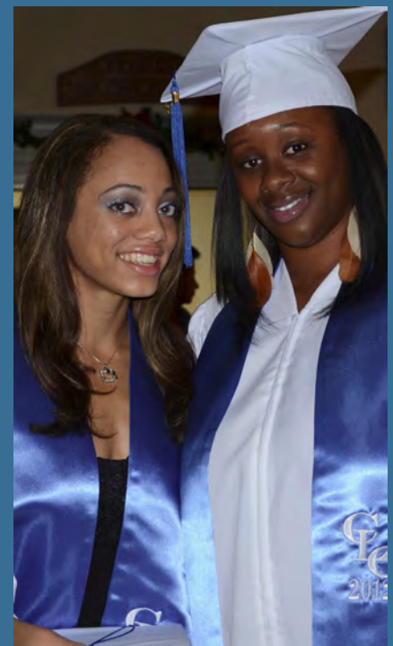
Hawthorne and Anaheim Campuses graduated VN, MIBC, MA, and DMS classes Dec. 21 at the Hawthorne Memorial Center.