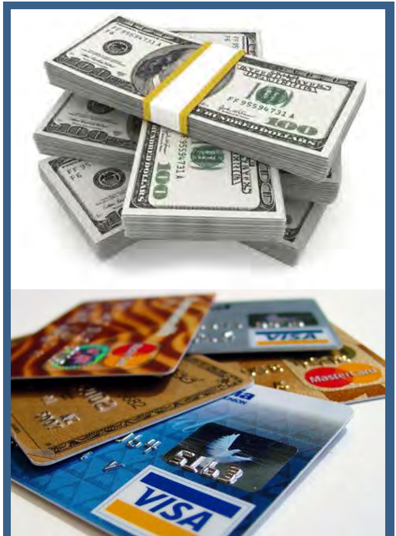
Working and saving money are still the best ways to improve finances.